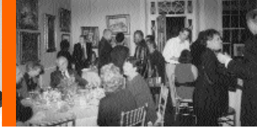
A scene at the Charleston Renaissance Gallery on October 31, 2002